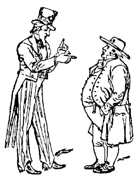
UNCLE SAM & BROTHER JONATHAN